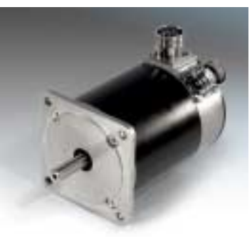
SM 56.3.18JX4,6B E50 with angled connectors series SM ...X...