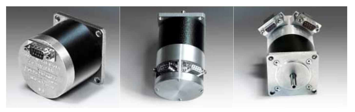
SM 56...Z154 with D-Sub connector